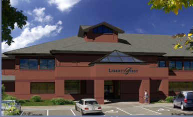
Main Office 465-1000 501 N. 46th St (46th & R)