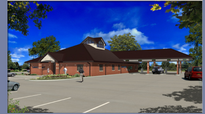
North Branch 465-1150 5101 N. 27th St (North of 27th & Superior)