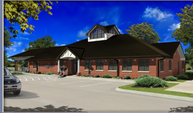
South Branch Office 465-1100 6001 S 56th St (South of 56th & Old Cheney)